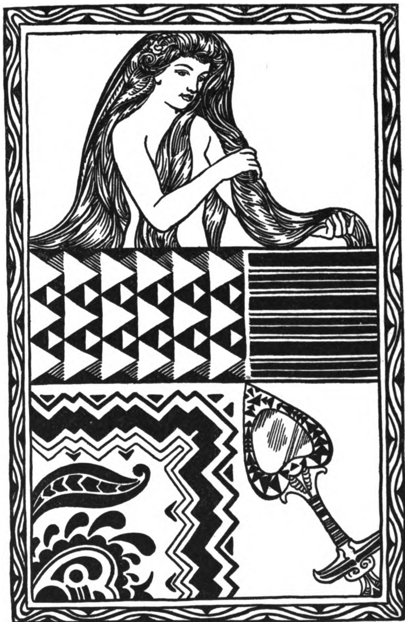
The Mirror, the Handkerchief, and the Embroidered Scarf